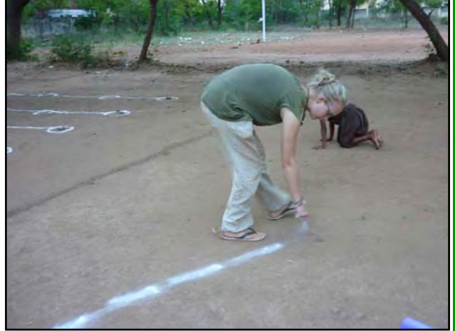
Preparation of the Ground