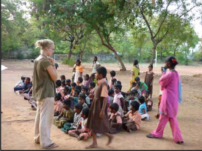
Gathering the Children