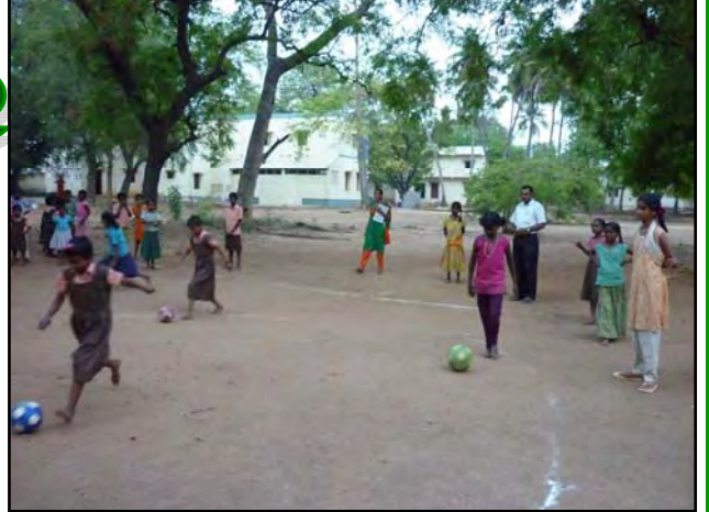
Game - Passing the Ball