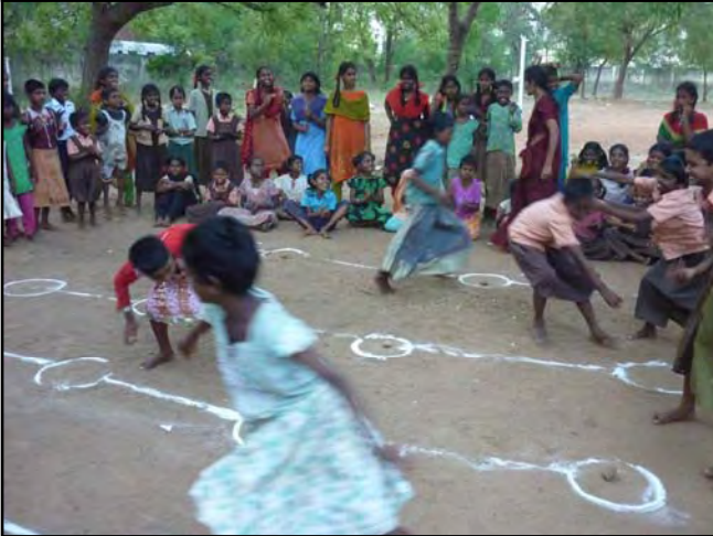
Game is - Potato Relay