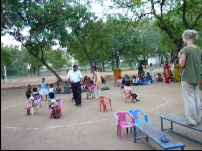
Playing Kids Musical Chair